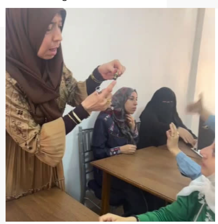
When the trainee becomes the trainer!