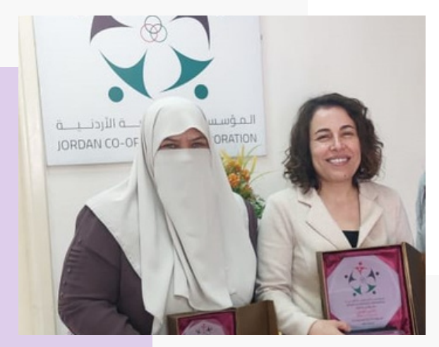
INTERNATIONAL WOMEN DAY